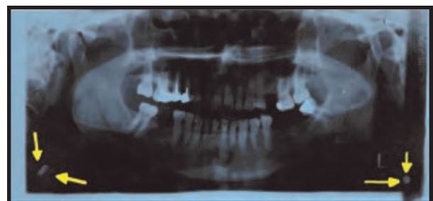
Arrows on panoramic radiograph point to calcified carotid artery atheromas.

Keep in mind these lesions can occur in other arteries of the body and cause heart attacks, which is referred to as coronary artery disease. Whether it is a stroke or heart attack depends on what area of the body that the artery feeds.