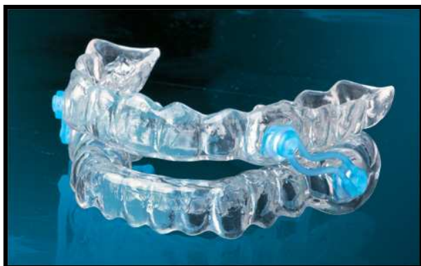
Silent Nite® Slide-Link

OSA is a serious disorder that not only can make a person feel exhausted, fatigued, have memory problems, feel depressed and/or have headaches but affects the brain and cardiovascular system as well. When the brain function and/or the heart become severely "oxygen-strained", then stroke, heart attack or even fatality can occur. OSA isn't just an adult condition, children can also have this